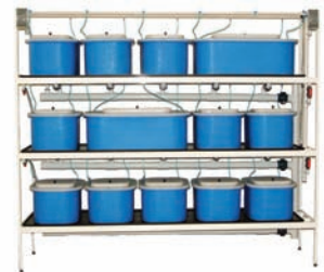
Powder Coated Stainless Steel Available