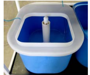
Polyethylene Tanks are available in 50 Liter and 100 Liter sizes

Many toxicology researchers are turning to the zebrafish model for use in their studies because zebrafish provide rapid, relevant, and low-cost results. However, standard zebrafish housing systems might need customization to meet the requirements of toxicology testing.