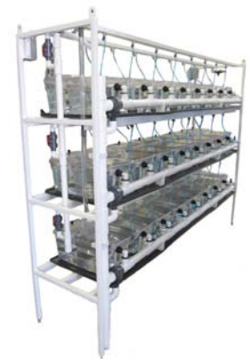
Rear of rack shows enclosed gutter system